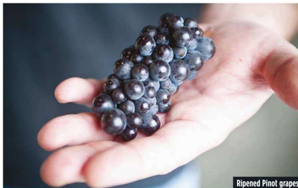
Ripened Pinot grapes